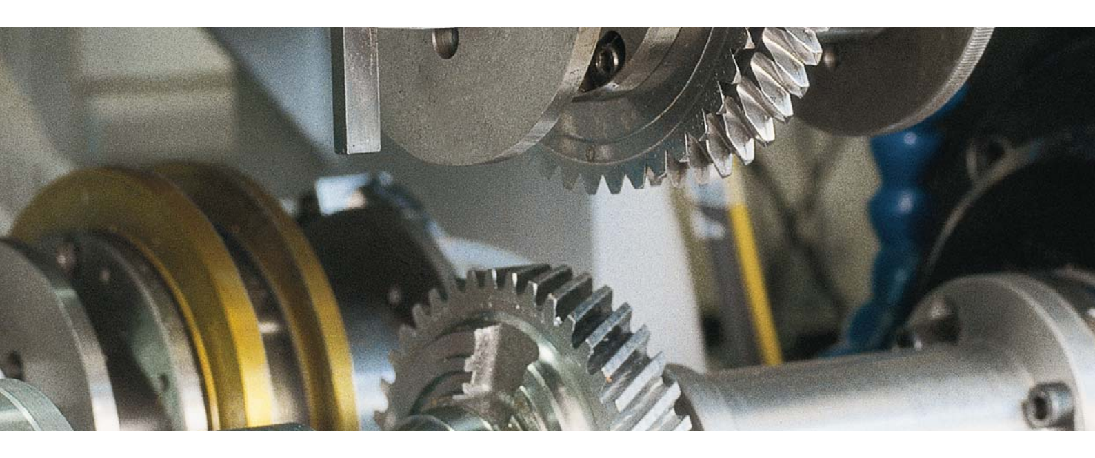
SCT 3 Universal Chamfering and Deburring Machine